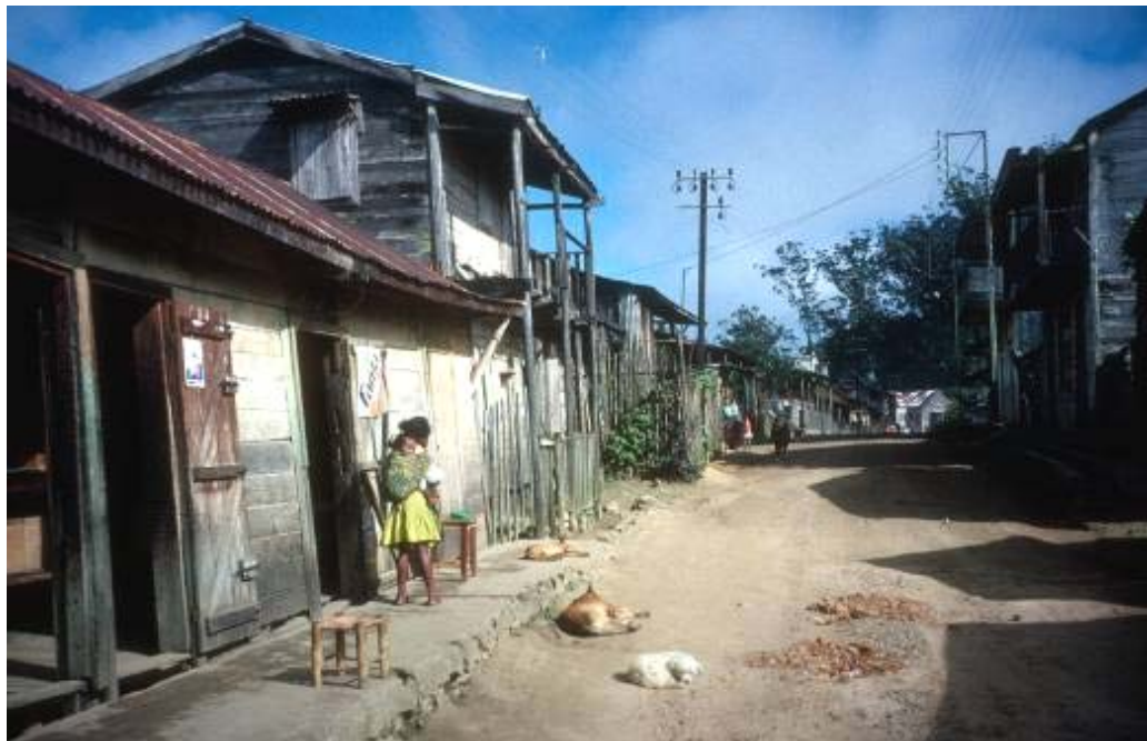
Figure 5. View of a residential section of Andasibe.

True to the Malagasy proverb, "those around the forest don't have big houses," the project laborers lived in much humbler accommodations (figure 5). Without university or professional diplomas, these workers earned an equivalent of between $240 and $390 annually. All low-wage workers of the ICDP The typical house of a wage worker consisted of a simple, square wooden structure raised a couple of feet off the ground on wooden stilts with a shallow veranda and uneven floorboards. The plank walls were insulated with reed mats and decorated with magazine cutouts or the faded publicity flyers of presidential candidates. Possessions typically included a couple of bed frames with sponge-foam mattresses, a wooden table and chairs, a few worn plates and utensils, two iron pots, and a charcoal stove.