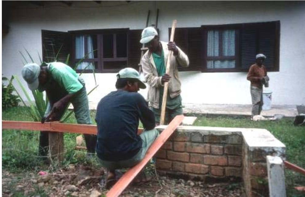
Figure 3. ICDP workers at Andasibe-Mantadia rehabilitating the office and grounds (Credit: Genese Sodikoff, 1997).

The case, moreover, fills a gap in political ecology and the "grey" literature of conservation and development, the latter term referring to the unpublished field reports and evaluations of conservation and development institutions. The gap concerns the subject of labor in conservation efforts, which are integrally tied to the development of green capitalism in rain forest regions. Conservation, I argue, devalues labor as a factor of production, and labor's devaluation poses obstacles to the longevity of green capitalism in poor countries such as Madagascar.