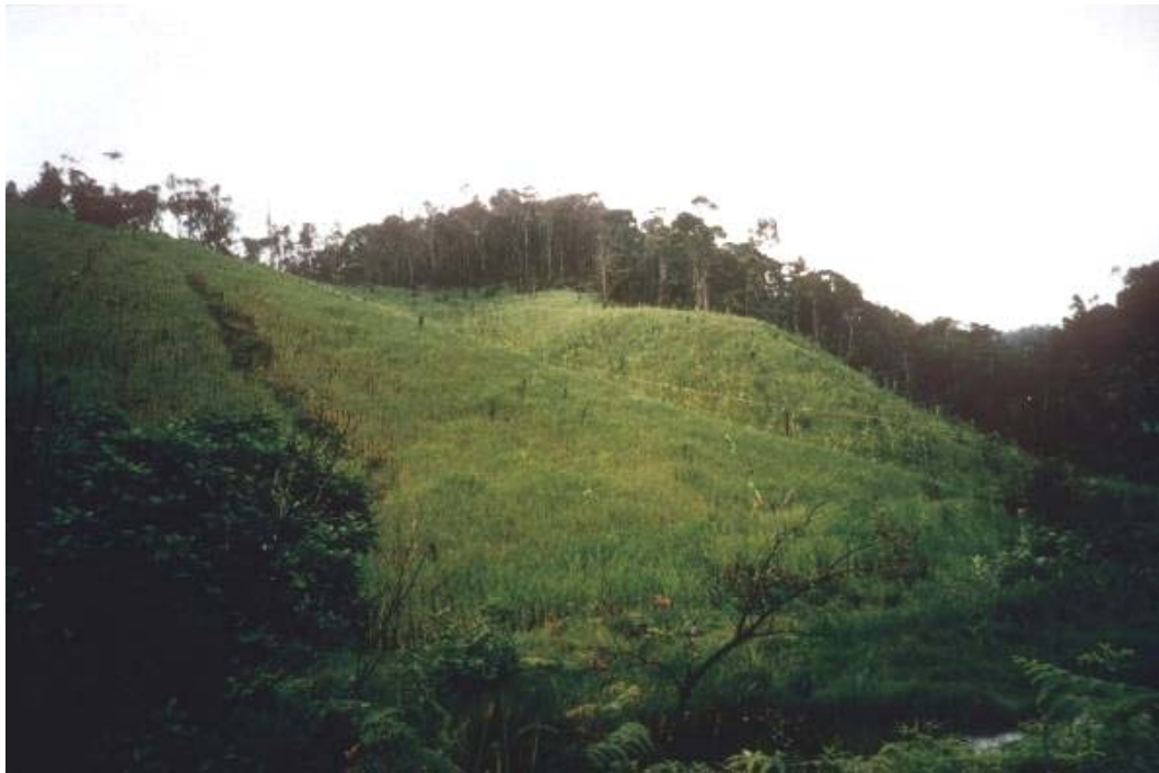
Figure 7. Tavy parcel in the Mantady forest.