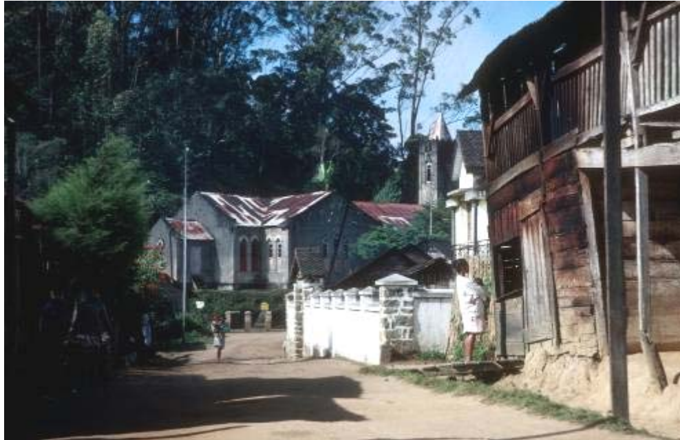
Figure 1. View of the town of Andasibe (or Perinet), a popular destination for tourists heading to the east coast of Madagascar (Credit: Genese Sodikoff, 1994).

The Special Reserve of Andasibe lies on the outskirts of a Malagasy railway town whose train station doubles as a restaurant-hotel (figure 1). The station's teak floors and rafters, its resplendent bar and grandiose murals, conjure up visions of colonial officers waiting at their leisure for the steam locomotive. The nearby forest reserve shelters the indri lemur (the largest of Madagascar's primates) and an orchid park. It is a fragment of a larger protected area which encompasses a montane rain forest named Mantadia. Opposite the entrance to the Special Indri Reserve stands the office building of an office of the Integrated Conservation and Development Project (ICDP) whose administrators and staff oversaw the protected area from 1992 until 1997 (figure 2). In Madagascar, ICDPs aim to reduce pressures on rain forests caused by tavy , a form of shifting, swidden horticulture long identified by scientists as the principle cause of forest erosion since the island's colonization by humans some 2000 years ago.