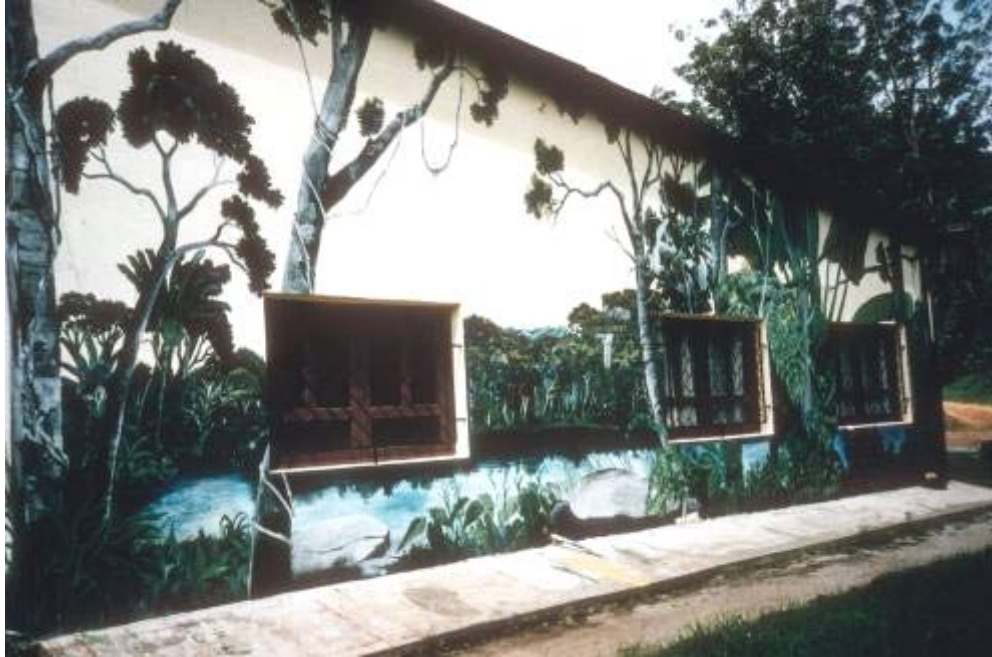
Figure 2. Back of the project office building at the Analamazoatra forest station, near Andasibe, Madagascar.

The American nonprofit consultancy organization (a species of "nongovernmental organization") leading the project and was nearing the end of its contract. ANGAP ( Association Nationale pour la Gestion des Aires Protégées ), the newly created Malagasy park service, was about to take over the reins of the project. The office building had aged rapidly in the two years since I had last seen it in 1995. The walls were cracked, the running water had stopped, and mud oozed up from the mosaic marble floors. About thirty unskilled conservation workers ( ouvriers ), along with masons and carpenters brought in for the task, were strenuously hammering posts into the ground, filling holes with cement, and erecting a low brick wall, while others crushed rocks with spades to make gravel.