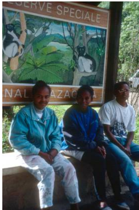
Figure 6. Guides waiting for tourist-clients at the entrance of the Special Reserve of Andasibe.

The guides refused to become employees of the project because they feared a drop in their income and a restriction of their freedom. One guide told me that ANGAP offered guides a salary between 150,000 and 200,000 FMG ($30-40) per month. But the high tourist season yielded daily incomes for guides of 100,000 FMG ($20). In 1996, the Andasibe guides formed an association. The association aimed to strengthen their standing and to dissuade individuals from accepting official guide positions from project management, which would have undercut the position of the others.