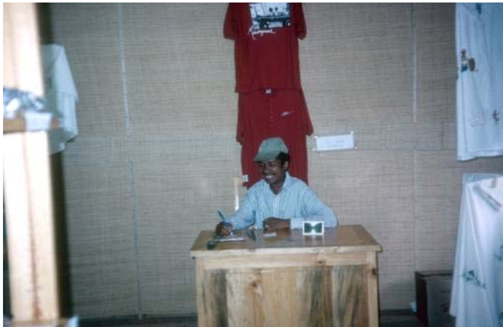
Figure 8. A conservation agent takes on new duties selling items in the tourist gift shop of the ICDP (Credit: Genese Sodikoff, 1997).

We said, "we can't accept that you'll take over Andasibe with new people from Antananarivo because we are the ones who have worked here for years so that this reserve is still the way it is. Why would you bring someone that has not made himself weary with labor in Andasibe?" If ANGAP doesn't hire the Andasibe employees, we'll be obliged to fight because we're the ones who have taken the pains to make the place beautiful.